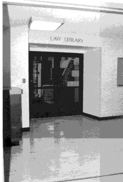
New library entrance