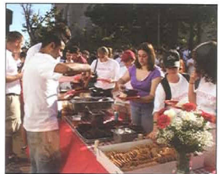
First-year students contribute a day of service to various Madison community programs.